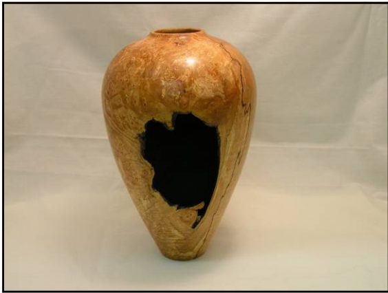
Hollow Form Vase - 7in x 13in - Maple Burl Larry Stevenson