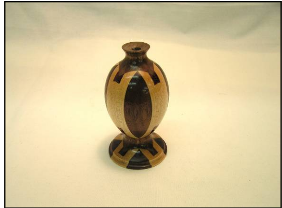
Bud Vase - 2-5in x 4in - Mitchell Visser