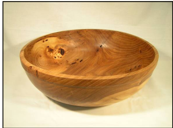
Green Turned Bowl - 6in x 3in - Cherry Lance Rossington