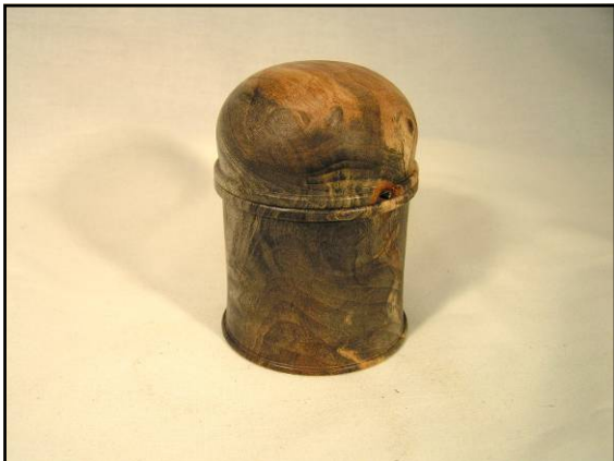
Box - 2in x 3in - Buckeye Burl - Kerry Deane-Cloutier