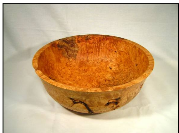
Bowl - 10in x 4-5in - Maple - Doug Bryson