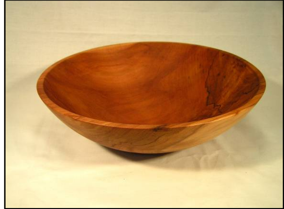
Bowl - 12in x 4in - Apple - Kerry Deane-Cloutier