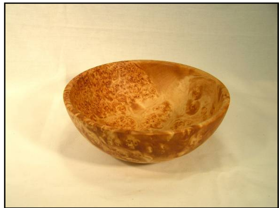
Bowl - 6in x 3in - Birch Burl - Dennis Cloutier