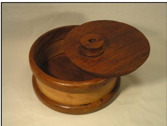
Bowl and Lid - 8in x 4in - Walnut & Birch Paul Blattler