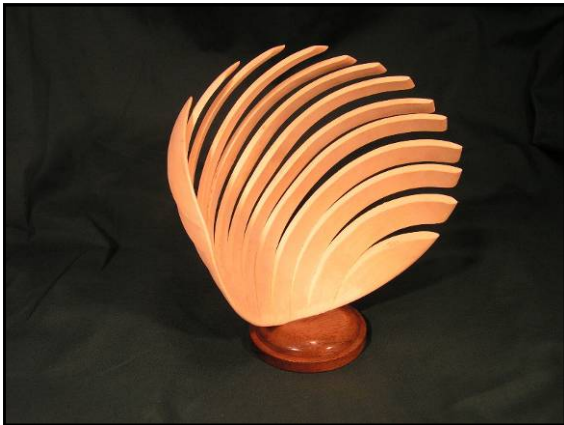
Flying Away - 6in x 7in - Beech - Marco Berera