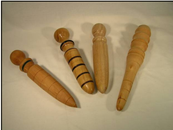
Dibblers from the last turning 101 on spindle turning

There will be a Turning 101 session at 9 AM on May 13, 2006, at Sapperton Hall. The topic is from blank to bowl. The June 10, 2006 session has a tentative topic on finishing bowls.