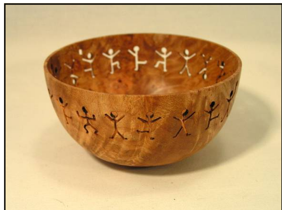
Endeavour to Persevere - 3in x 2in - Maple Burl - Art Liestman