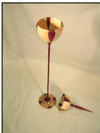
Goblet Box - 2in x 20in - Eli Avisera