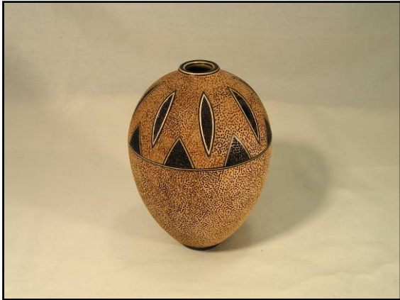
Hollow Vessel - 3in x 4in - Eli Avisera