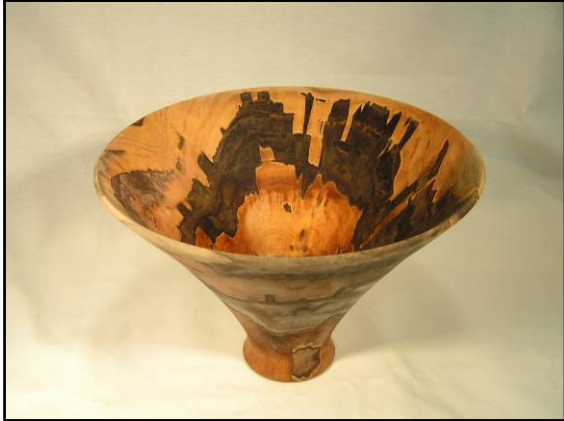
Vector Bowl - 9in x 7in - Japanese Red Maple - Bruce Campbell