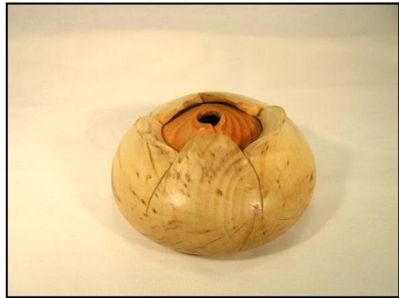
Hollow Form - 5in x 2-5in - Tom Kilgour