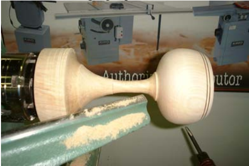
Dark rings made first with a skew, then burnt with wire