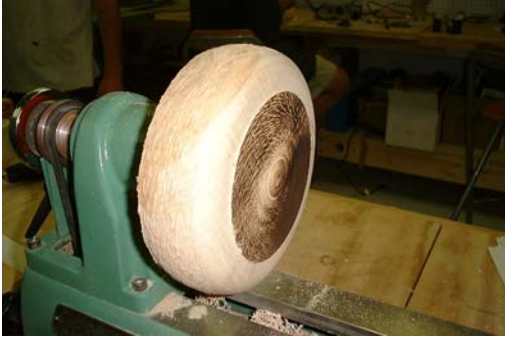
Carbonized using a propane torch