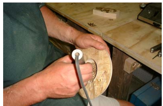
Woodburning S's into a bowl