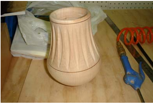
Coves cut using Flexshaft, dark rings burnt with wire