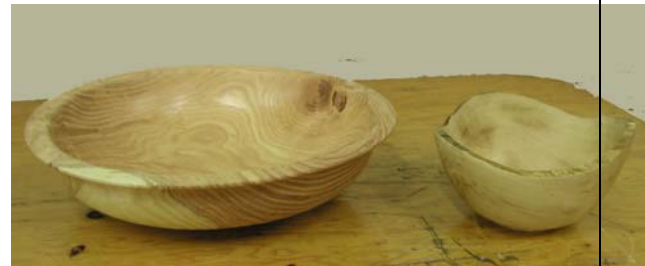
Merv Graham's acacia and maple bowls