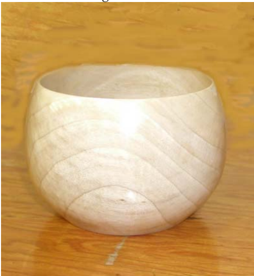
Ron Minshall's 'plain ol' walnut bowl'