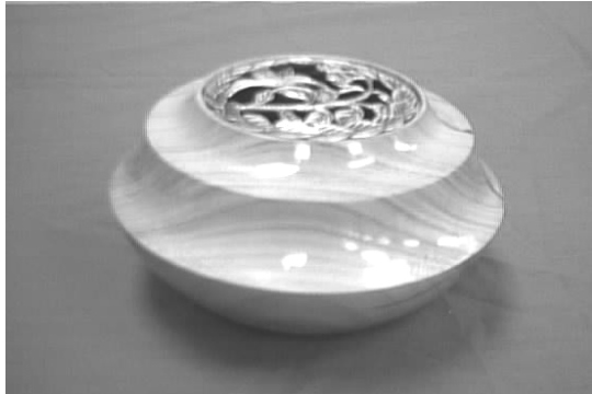
Potpourri Dish — Loren Boyle

Loren Boyle brought in a nice potpourri dish that will make someone very happy!