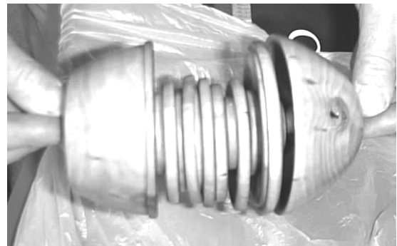
Marco's Mushroom — closed (top) and open (bottom)