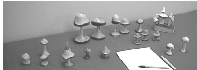
Mushrooms in May